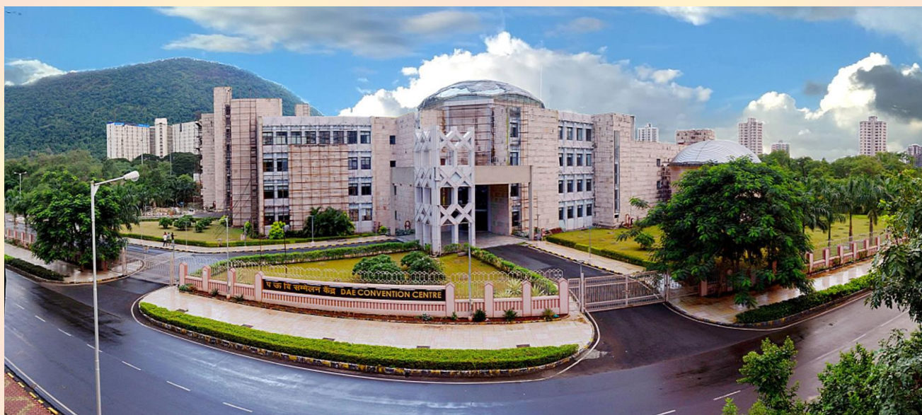
DAE Convention Centre Anushaktinagar

People coming to Mumbai by train can alight at Mumbai CSMT, Dadar, LTT, Mumbai Central, and Bandra Terminus. Those travelling by flight will alight either at the domestic airport at Santacruz or at the Chhatrapati Shivaji Maharaj International Airport at Sahar. Anushaktinagar is located around 20 kms from the Airport and Railway stations. Prepaid taxis are available at most of the railway stations and the airports. The weather in Mumbai during March is pleasantly warm, with temperature ranging between 28°C and 32°C.